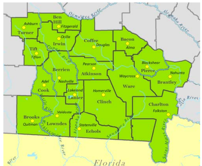
Suwannee-Satilla Council Boundary